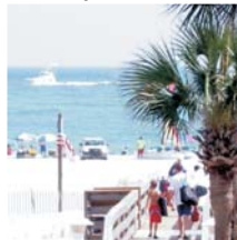
Orange Beach, Alabama

Effective June 1, City of Orange Beach dental coverage will change from Assurant to Blue Cross Blue Shield. Check with your supervisor to verify dentists available in the new plan. Details will follow.