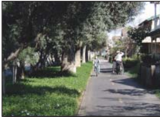
Improved Bike Paths