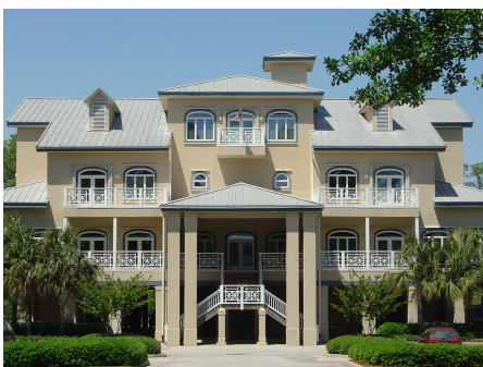
Community Health Systems Corporate HQ